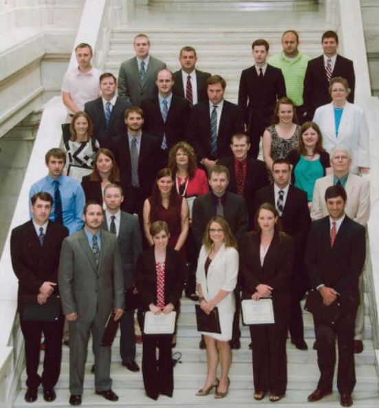
2013 Swearing-In Ceremony Honorees